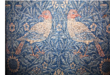
Bird hand-woven double cloth William Morris 1878