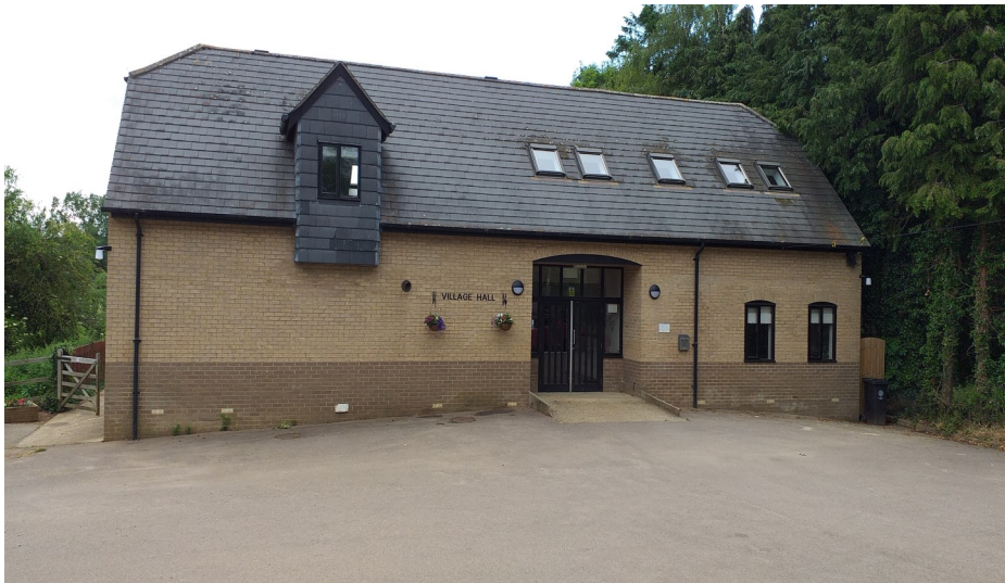
A REFURBISHED BRIGSTOCK VILLAGE HALL