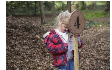
National Trust Images

This spring, treat your little ones to a world of adventures at Lyveden on the Easter adventures in nature trails. Make your way along the trail, finding nature-inspired activities for the whole family. Make your way along the trail and find nature-inspired activities for the whole family. The trail takes place between 15-18 April 2022, from 10.00 to 17.00, with last entry at 16.30, so come along and explore the beautiful parkland of Lyveden. The price of the trail is £3 per child and includes a trail map, pencil and a chocolate egg at the end.