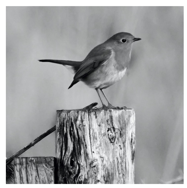
PRODUCED BY THE VILLAGE HALL COMMITTEE