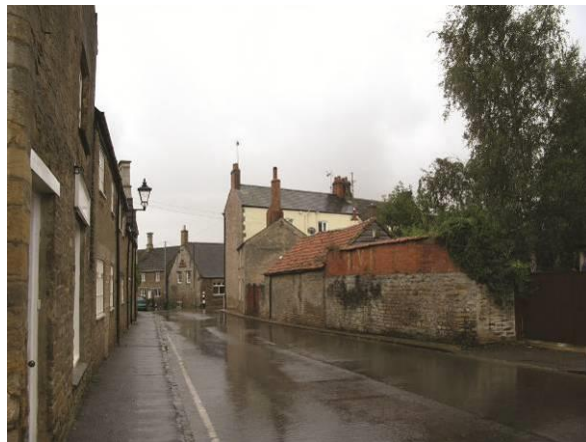
Raised wall in brick at rear of No.2 Hall Hill

The most prevalent building material is the local Jurassic limestone, once quarried nearby. The overall character of the conservation area is therefore defined by its warm yellow/brown colour which darkens with age. This stone can be seen on almost all of the buildings apart from the odd brick-built structure. The limestone is used either as rubblestone, with ashlar blocks for dressings such as lintols and quoins, or in coursed ashlar blocks. There are no obvious examples of the use of decorative ironstone banding, found elsewhere in East Northamptonshire, apart from part of the Manor House. This may reflect the relatively low status of the buildings in Brigstock, many of which were built as farm houses, barns, stores or labourers' cottages.