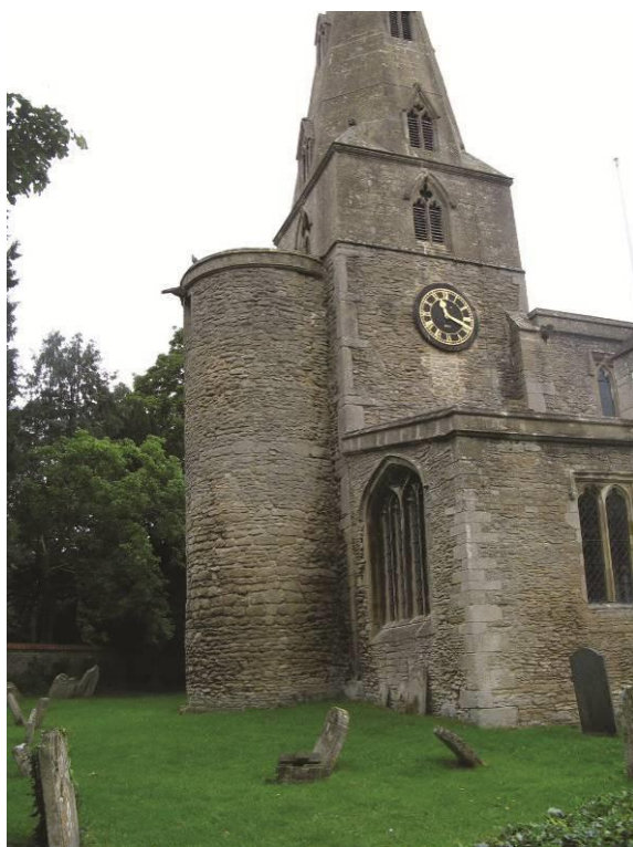
The late 10 th century staircase, St Andrew's Church

St Andrew's Church retains a late 10th century staircase tower and features of the 12th, 13th and 14th centuries. It is built from coursed limestone rubble with dressings made from limestone ashlar blocks. The mainly 14th century spire is faced in similar limestone blocks with coursed limestone and has three bell chamber openings on each of the four faces. It is roofed in lead.