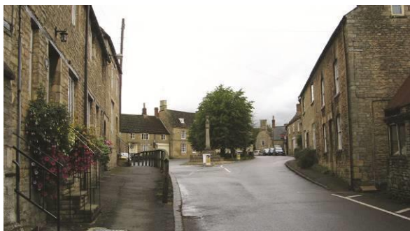
Hall Hill from Church Street

At the top end of Hall Hill, the road turns sharply left and becomes the High Street, or, to the right, descends down the hill (StableHill) to a back lane (The Syke) which leads towards Kennel Hill and Lyveden Road.