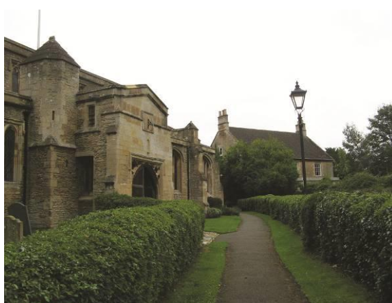
St Andrew's Churchyard

At the junction with Back Lane, High Street widens as it leads out of the village towards Stanion. Development is all on the northern side, with fields to the south, dropping down a slight incline to Harper's Brook.