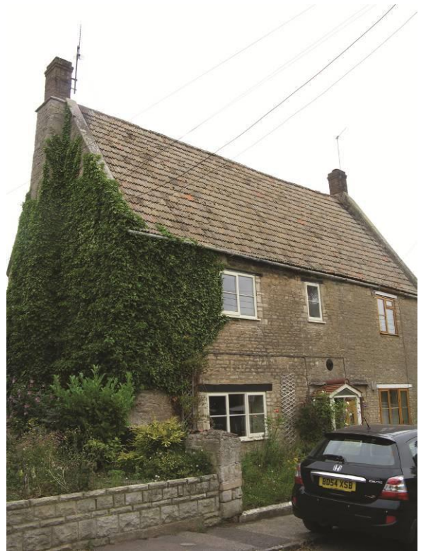
Nos.22 – 24 Bridge Street

Unfortunately, the original roof coverings of many of the historic buildings in Brigstock have been replaced with concrete tiles or machine-made clay tiles which lack the texture and colours of the original materials.