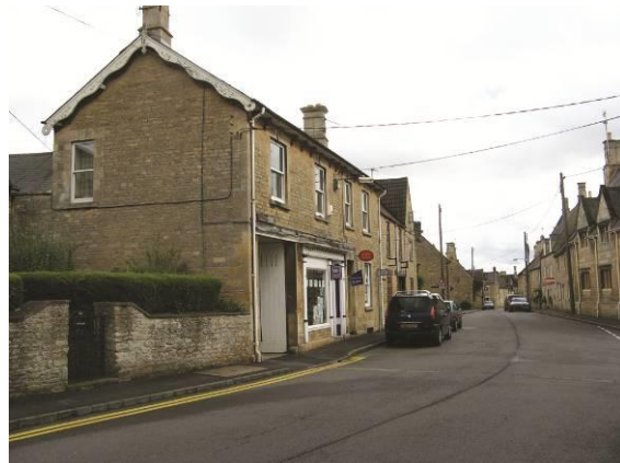
Brigstock Post Office, High Street