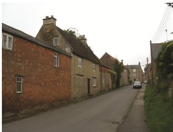
Former barns in Stable Hill

Of note is the variety of gables or flat fronts which face the street, because some of the buildings sit at right angles to the street. This gives the streetscape a pleasing rhythm which is improved by the indenting of some of the frontages with small front or larger side gardens. There are no 'polite' terraces or set pieces of architecture, the overall character being of vernacular forms, developed slowly over a long period of time. The survival of several farm groups, with long, low barns, in the village centre, is another notable feature of Brigstock.