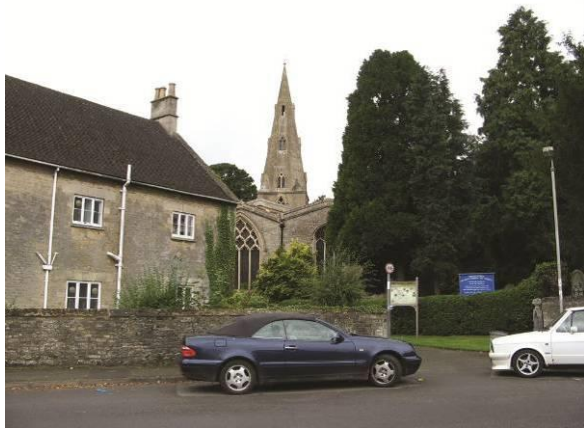
St Andrew's Church from Church Street

The buildings in the conservation area are typical of a small rural village and include the parish church of St Andrew's, the Manor House, a non-conformist chapel, and a school and schoolmaster's house, all purpose built. The two public houses, whilst they have been in commercial uses for many years, retain a domestic scale. Even the village store (the Coop) is located in what was once clearly a house. Otherwise the buildings were built either as houses or for agricultural uses, although nearly all of these (including the town mill) have since been converted to residential uses. Of interest are the high number of smaller barns and stores which can be seen throughout the conservation area, sometimes too small for residential conversion and therefore left for alternative uses such as workshops or offices. Of the historic houses, there are examples dating to the 16th century onwards, although from the street the varied buildings appear to date to the 18th or 19th centuries. The exception is the very early Manor House, though this cannot be seen from any public viewpoint except from a distance.