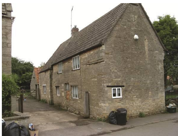
Listed cottage in Bridge Street