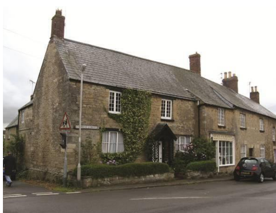
Listed cottage in Church Street

At Brigstock the buildings are largely built from limestone, which was quarried locally – former quarries are shown on modern maps at Weldon and Lower Benefield. This is either used as a rubble stone or the better quality deposits can be dressed and used as the more prestigious ashlar blocks. Collyweston stone 'slate' can be seen on many roofs in Brigstock, brought over from limestone quarries closer to Stamford. Further south, around Higham Ferrars, the limestone gives way to Upper Jurassic Oxford Clay, which provides the raw material for roof tiles and brick. Sand pits around Brigstock can also be seen on historic maps.