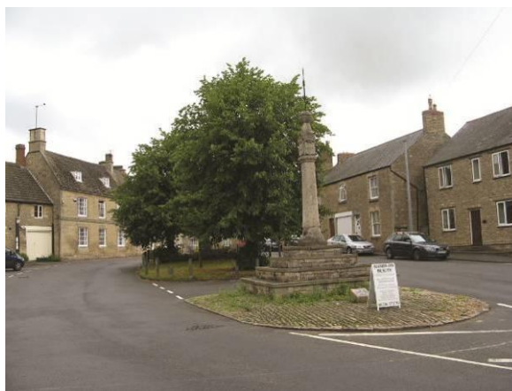
Hall Hill, the site of the medieval market place

Brigstock's once moated Manor House is located close to the church and the earliest parts of the building, the great hall, can be dated to c1150. The Manor House was founded as a royal hunting lodge, and King John, visiting a number of times at the turn of the 13th century, is known to have held court there in the February of 1207. In subsequent years the residence was to be converted to the status of a private house, entering the ownership of the Montagu family, ancestors of the Dukes of Buccleuch, around the turn of the 14th century.