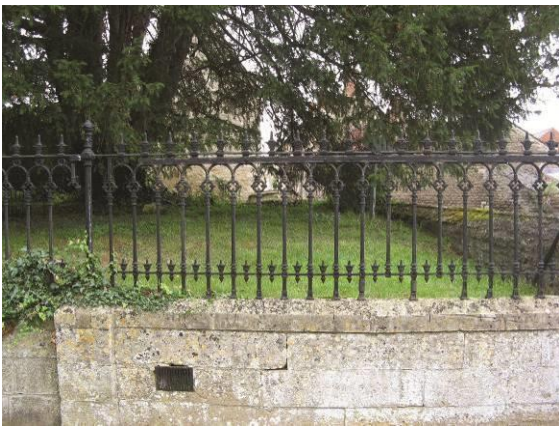
Cast iron railings to St Andrew's Churchyard

Orange Roman clay pantiles are also used in several locations to provide a weather-proof coping to thick stone walls. There are examples around the Manor House, facing St Andrew's Churchyard; in the back garden of no. 2 Hall Hill, where they top the brick garden wall; and in several locations in Back Lane. Highly decorative cast iron railings to St Andrew's Churchyard are of special note. Less visible, but entirely appropriate to their setting, are the simple wrought iron spiked railings to allotments next to Harper's Brook.