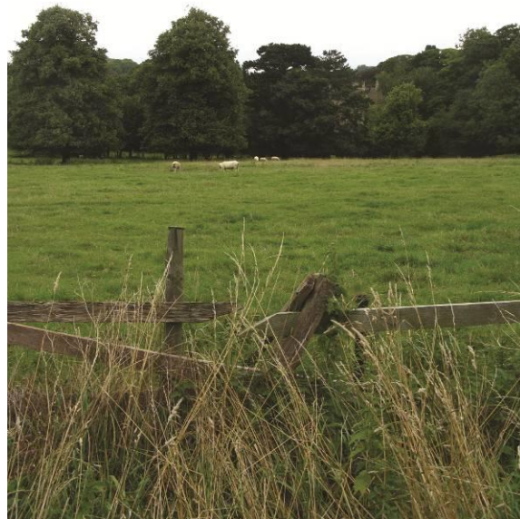
Trees around the Manor House from Park Walk

Significant trees or tree groups are marked on the Townscape Appraisal map. Lack of a specific reference does not imply that a tree or tree group is not of value.