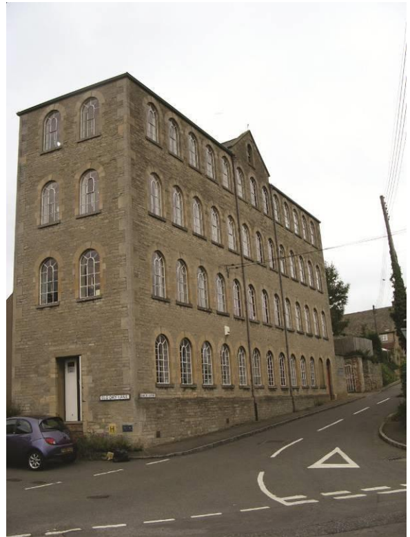
Wallis's Mill, Back Lane