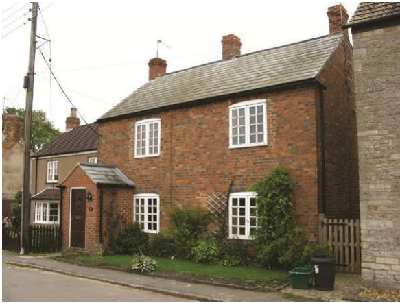
No.17 Bridge Street

In contrast to the almost universal use of limestone for walls, the roofs of Brigstock provide a great variety of materials, principally Collyweston stone slates, thatch, clay pantiles of varying colours and profiles, and natural slate. Collyweston stone slates are made by splitting limestone – a process which historically was achieved using natural frost action. The use of this material started in the 17th century if not earlier – it is known that by 1633 there were both open pits and mines in the fields around the village of Collyweston near Stamford. However the ready availability of mass produced roofing materials and the import of slate from Wales via the new railways of the mid 19th century, meant that many of the Collyweston slate roofs have been replaced in the much flatter natural slate which does not provide the undulating, richly textured finish of the stone slate. The Collyweston Stone Slaters' Trust ( www.collywestonstoneslaterstrust.org.uk ) aims to keep the traditions of stone slating alive and can provide details of craftsmen who are able to carry out this very specialised work. Examples include no. 2 High Street; no. 16 High Street; and no. 35 High Street.