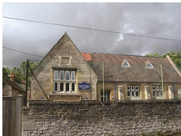
Latham's School, Latham Street

During the 20th century, the history of Brigstock was to become involved with that of the neighbouring town of Corby. A camp was founded on Stanion Road to accommodate the Scottish workers drawn to Corby's steelworks, and between the 1920s and 1960s the parish saw the opening of sand quarries to provide building materials for the rapidly expanding town. By 1986, however, the area had been converted to a country park. The 1927 map records two saw mills in Brigstock, no doubt utilising the timber from the adjoining woodland. Today, Brigstock remains a popular village with around 43 listed buildings, surrounded by attractive countryside and now thankfully bypassed by the busy A6116.