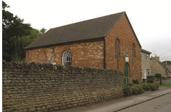
The Primitive Methodist Chapel of 1843

Both of these survive albeit altered. Although no longer a place of worship, the brick built Primitive Methodist Chapel of 1843 still stand in Park Walk, and today is home to the Women's Institute.