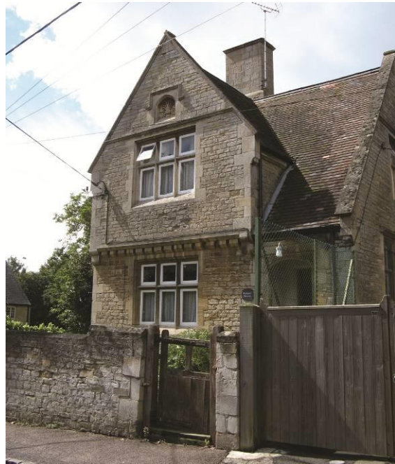
Headmaster's House, Brigstock and Lathams C of E Primary School, Latham Street

The conservation area contains the Parish Church of St Andrew's, the Brigstock United Reformed Church, and Harper's Court, a modern building on the bank on Harper's Brook providing sheltered housing for the elderly. A modern Village Hall and adjoining Doctors' Surgery can be found in Bridge Street. The Brigstock and Lathams C of E Primary School is located between Bridge Street and Church Street, encompassing both historic and modern buildings.