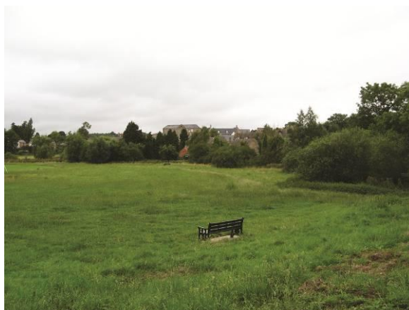
View over Harper's Brook from Bridge Street

Buildings facing the field to the south of Harper's Brook along Park Walk and Bridge Street, are mainly is totally rural in character, and many have spacious gardens which are visible from the road.