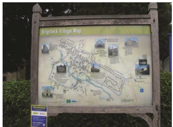
Brigstock Village Map

In Mill Lane there is an attractive cast iron drain cover with the notation 'Crapper and Co Ltd Sanitary Engineers'. The Brigstock Village Map, located next to St Andrew's Church, provides visitors with information about the village and suggests a route for a walkabout.