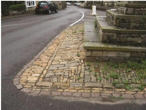
Detail of stone paving in Hall Hill

In many places there are no pavements or only limited provision due to the narrowness of the historic streets. Pavements, where they exist, are usually covered in black tarmac with a brick-on-edge kerb (Hall Hill) or a narrow (300 x 100 mm) stone or concrete kerb. Very occasionally these are wider – for example, in the High Street. Around the Market Cross in Hall Hill, there is an area of sandstone paving, made from varied sizes of limestone set out in a rough pattern. This appears to be the only area of traditional stone paving in the village, though there was probably more in the past. Outside Yorks Row, the access alley is paved in large bricks, which would appear to date to the late 19th or early 20th century.