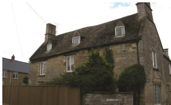
No.2 High Street

No. 2 is a limestone house set at right angles to the High Street with date stones of 1588 and 1730. It is built from squared coursed limestone with an ashlar gable end and Collyweston stone slate roof.