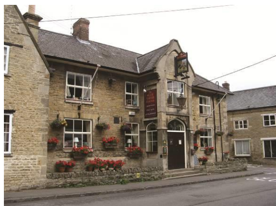
The Three Cocks Public House, High Street