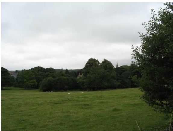
View from Park Walk to church spire