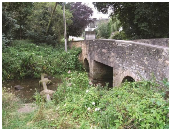
The bridge in Grafton Road

The name 'Brigstock' perhaps denotes the stockade by the birch trees or the shrine by the bridge . The present village was established during the Anglo Saxon period, and endowed with a church from at least the ninth century. This early building was destroyed by Danish raiders, but parts of the present parish church of St. Andrew – for example the nave, and, most notably, the west tower – can be traced back to a substantial building of the late 10th or early 11th century. The church was a foundation of some significance – in addition to serving as a soke centre, Brigstock appears to have held some responsibility for the chapels of neighbouring villages. By the time of Domesday Book in 1087, the settlement of Bricstoc was recorded to have both a watermill and a resident priest.