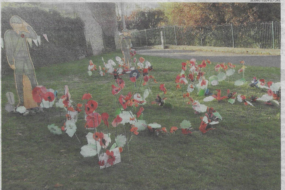
Brigstock Primary School's Remembrance display

asked to research significant memories to write on the poppy leaves, and many of these have poignant family links to the world wars. We have 100 poppies in the main part of our display, and we have also created poppies for all the fallen soldiers of Brigstock. The art club of the school has also created soldiers, bunting and extra poppies."