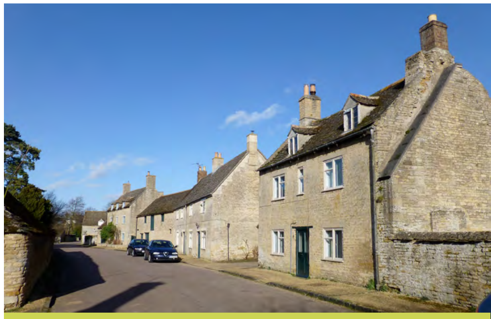
Duddington village high street, typical of the area, with houses built with local limestone and using the heavy Collyweston roofing slates.

The area comprises two culturally distinct sub-units, the Rockingham Forest and Soke of Peterborough, which nevertheless share many similar physical characteristics. The Rockingham Forest area takes its title from the Royal Hunting Forest that existed across the area from the 11th to the 19th century. The forest's modern extent is defined by a combination of these former legal boundaries and its physical characteristics. The Soke of Peterborough was also a distinct administrative area for many centuries and this title is still used to define the physically distinctive countryside to the west of Peterborough.