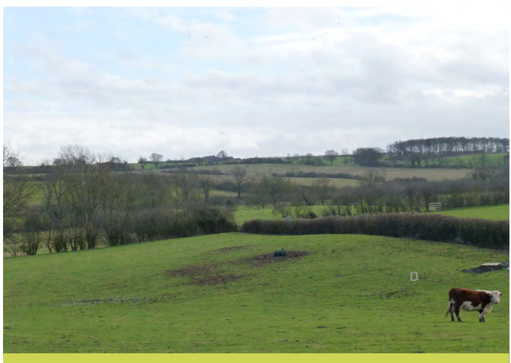
Landscape view showing the typical small mixed arable and pasture fields enclosed by well maintained hedgerows with numerous hedgerow trees.