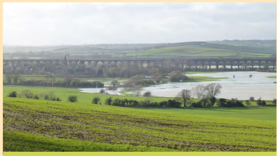
Looking west along a flooded Welland Valley and the Haringworth Viaduct and into High Leicestershire NCA.