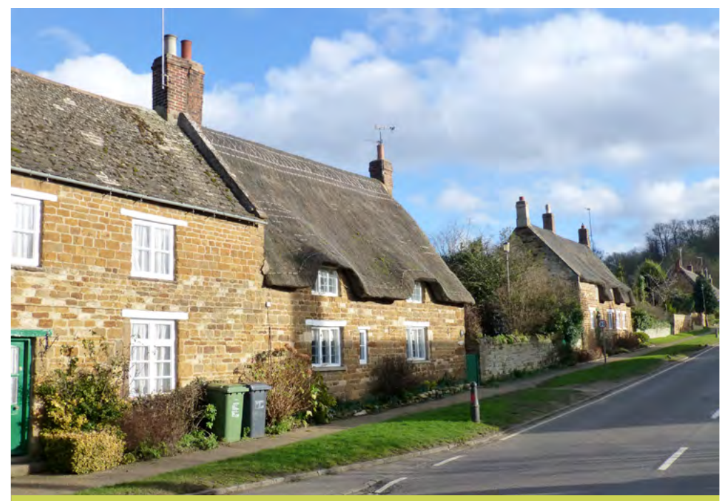
Rockingham village high street with the ironstone buildings typically found in the east of the NCA, roofed in Collyweston slates and thatch.

■ Geodiversity: There are two geological SSSI and 28 Local Geological Sites within the NCA. Barnack Hills and Holes is a redundant medieval limestone quarry which now supports internationally important species-rich limestone grassland. Around the fringes of the area, river gravels and sands are still being extracted for the construction industry. Both limestone and ironstone deposits were formerly quarried for use in local buildings. Limestone was transported far afield and used in the construction of Ely and Peterborough cathedrals. The distinctive Collyweston slate was quarried and used extensively as a roofing material in the local area. Iron deposits supported an important medieval and mid-19th-century iron industry.