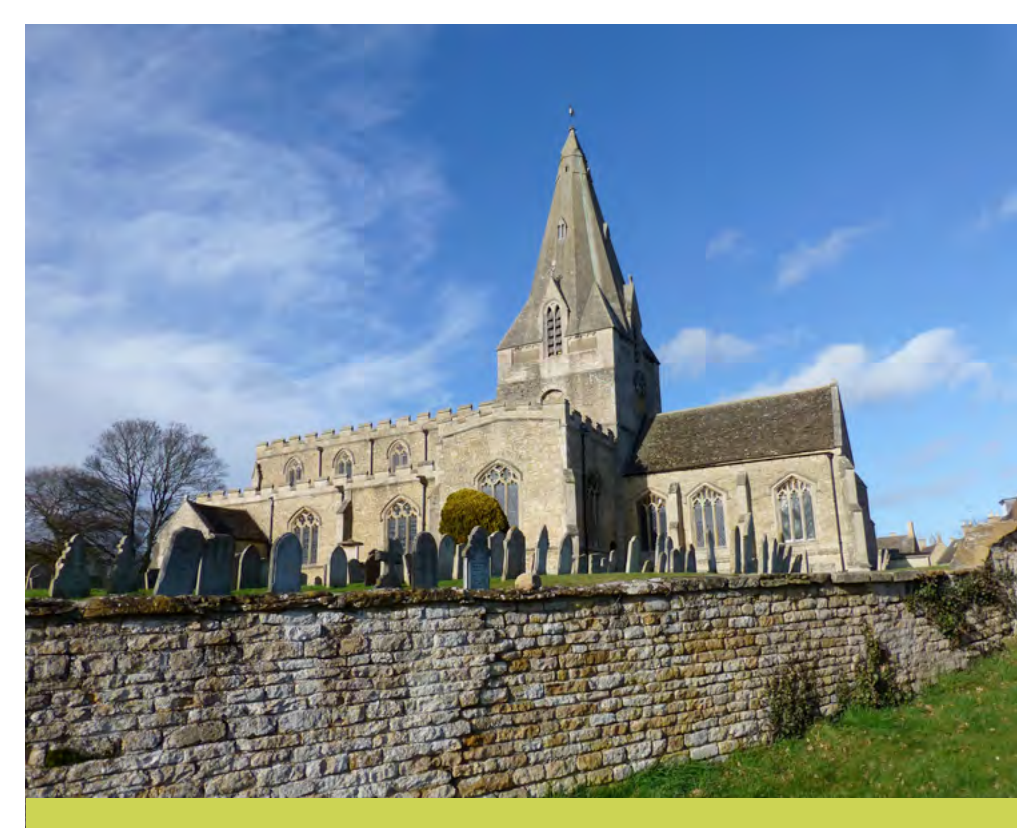
The striking historic Kings Cliffe village church, built using local limestone.

to produce charcoal. An ordered agricultural landscape dominated with scattered, small farmsteads. Archaeological excavations of iron kilns in Rockingham Forest suggest that the iron industry here may have been working on a scale not to be seen again until the Industrial Revolution. There was also a large Roman settlement at Castor where Ermine Street and King Street met. Substantial areas were cleared of woodland and large villas such as those found at Weldon and Barnack were established.