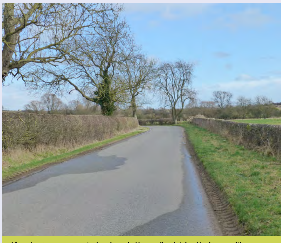
View along a narrow country lane bounded by a well maintained hedgerow with numerous hedgerow trees to one side and a typical drystone wall along the other.