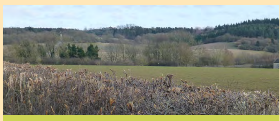
View of the enclosed wooded landscape looking across to Finneshades woodland.