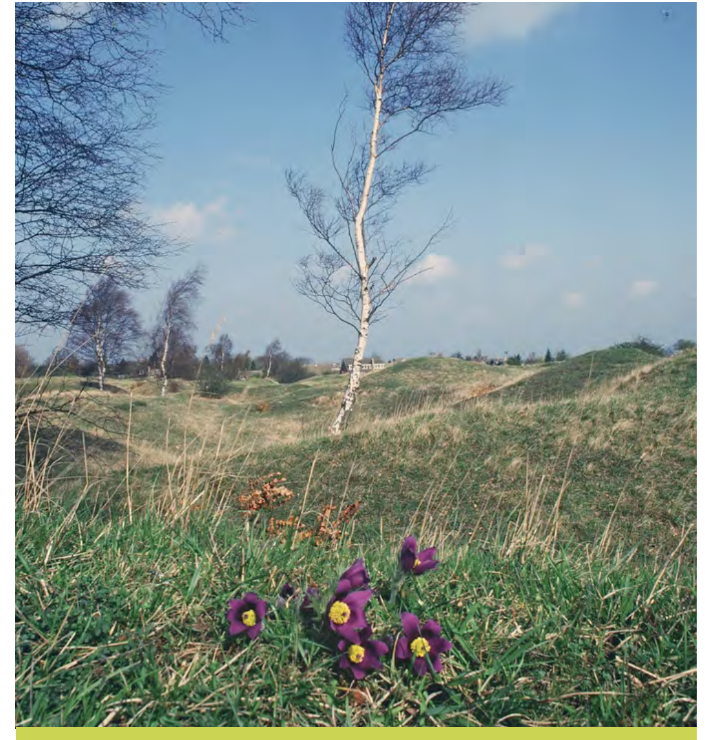
The limestone grassland at Barnack Hills and Holes National Nature Reserve with the stunning pasque flower growing in the foreground.

More information is available at the following address: http://www.cpre.org.uk/resources/countryside/tranquil-places