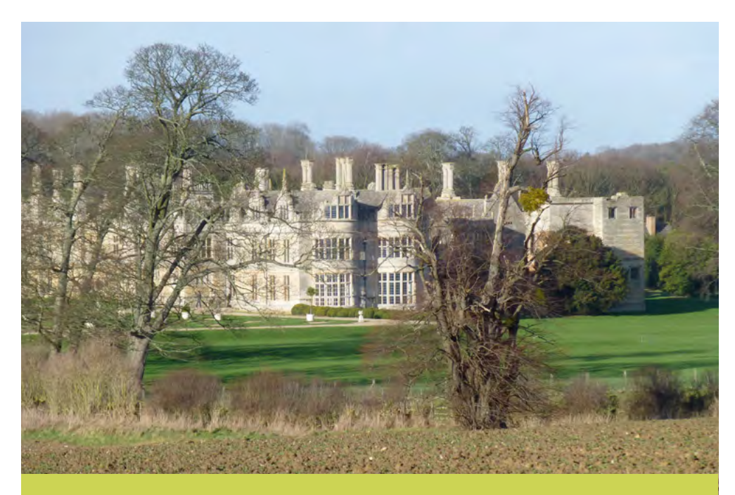
Kirby Hall, one of many fine country houses found in the landscape.

Woodland spread again at the end of Roman occupation and Saxon settlements lay mainly around the edge of the area as Royal or former Royal manors controlling the central woodlands. Indeed, the pattern of principal settlements lying around the edge of the forest has persisted to the present day and the centre of the area remains sparsely settled. On the north-eastern edge Meadhampstead, later to become Peterborough, was the site of one of the major monasteries of early Anglo-Saxon England. In the late Anglo-Saxon period, limestone was quarried in the northern part of the area, not least to produce the Saxon churches such as Wittering and Barnack. Barnack stone was transported by wagons and boats as far south as Essex, Bedfordshire and Hertfordshire.