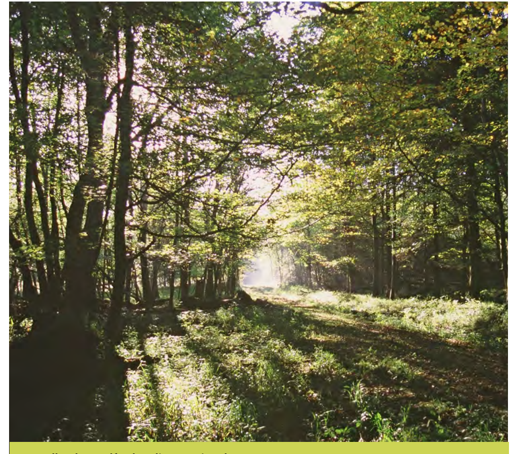
Woodland at Bedford Purlieus National Nature Reserve.

Biodiversity and geodiversity are crucial in supporting the full range of ecosystem services provided by this landscape. Wildlife and geologically-rich landscapes are also of cultural value and are included in this section of the analysis. This analysis shows the projected impact of Statements of Environmental Opportunity on the value of nominated ecosystem services within this landscape.